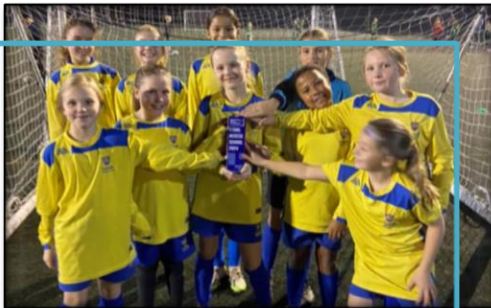
Equal Access School Award 2024