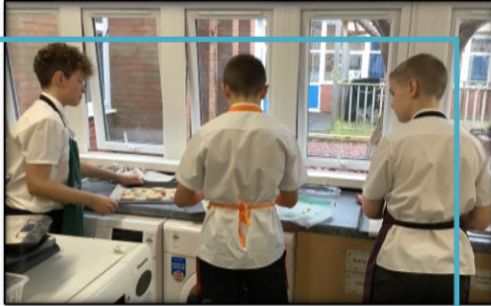
Senior Citizens' Party Preparation