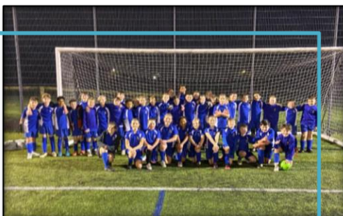
Boys and Girls Football Fixtures