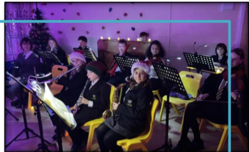
Christmas Carol Concert