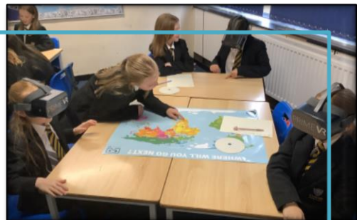
VR in Geography